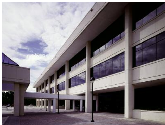
Customer Service Center, Blue Cross and Blue Shield of Louisiana, Baton Rouge, LA

Note: Numbers in parentheses ( ) are millimeters unless otherwise noted.