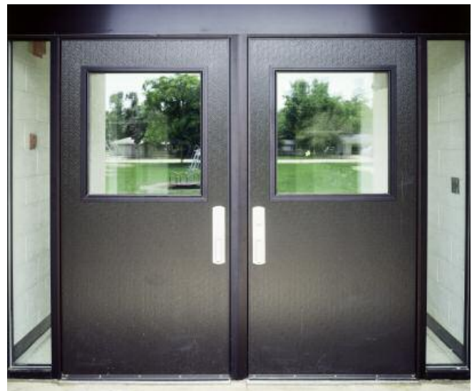
Eagle Point Elementary School, DeForest, WI Architect: Foth & Van Dyke, Green Bay, WI Glazing Contractor: Lake City Glass & Paint, Madison, WI

Solvent-free powder coatings add the "green" element with high performance, durability and scratch resistance that meet the standards of AAMA 2604.