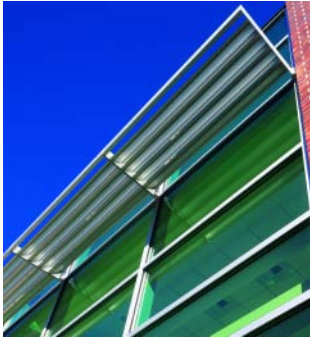
Colorado Plains Medical Center, Fort Morgan, CO Architect: Davis Partnership Architects, Denver, CO Glazing Contractor: El Paso Glass- Denver, Inc., Aurora, CO

The considerable savings in fabrication and attachment time compared with custom sunshades creates economies in budgets and construction schedules. In turn, these savings allow for the use of sunshades on even the most modest of structures.